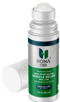
MUSCLE RELIEF ROLL-ON (ARNICA + CAPSAICIN)