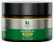
CBD MUSCLE & JOINT PAIN RELIEF GEL