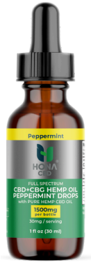
CBD + CBG FULL SPECTRUM