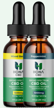
CBD BROAD SPECTRUM