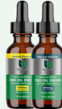
CBD 99% ISOLATE