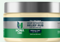
INTENSIVE CBD RELIEF RUB WITH EMU OIL